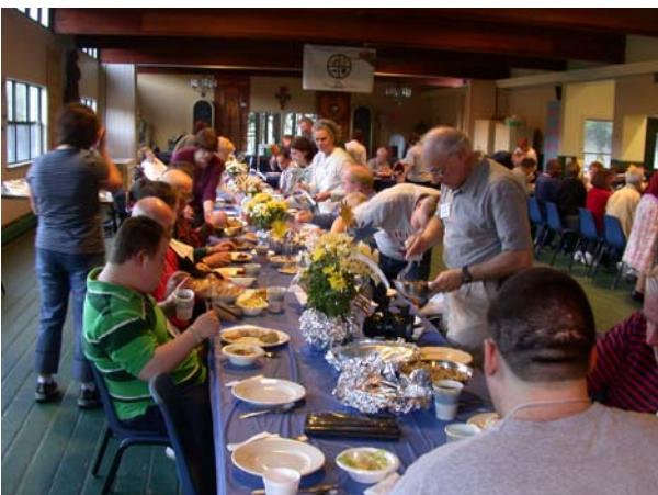
Participants & volunteers enjoying their meal