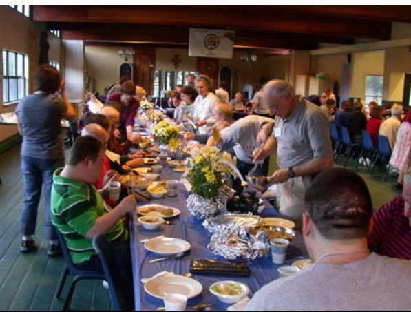
Participants & volunteers enjoying their meal