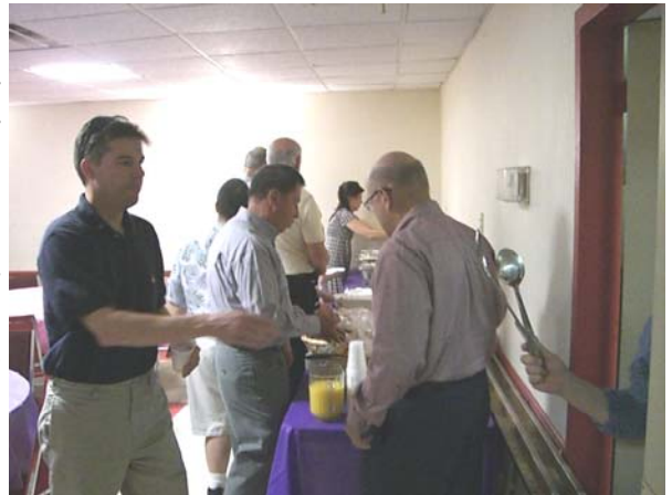
Pass the plate and enjoy the food at Communion Bfst